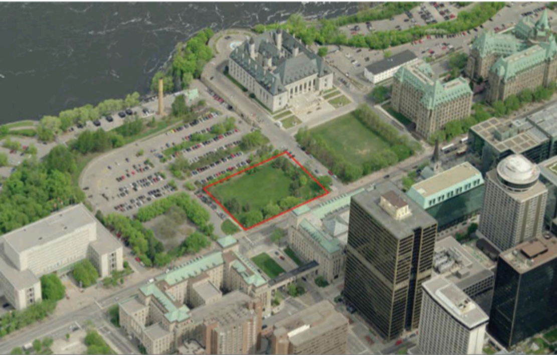
Air photo of site of proposed Memorial to Victims of Communism (Judicial Precinct)